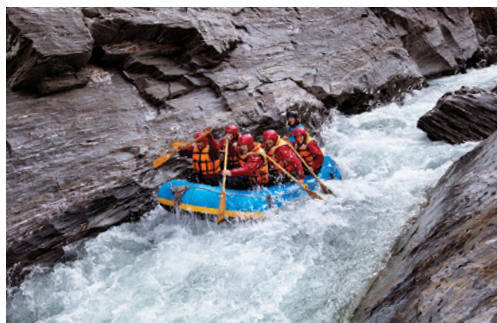
Shotover River — Grade 3 – 5