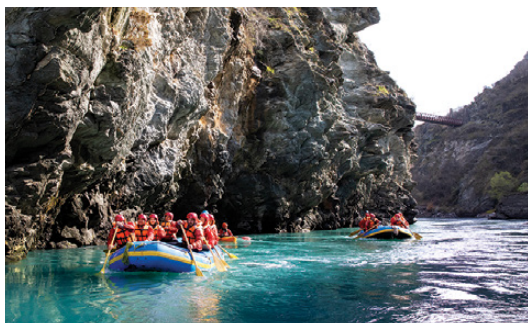
Kawarau River — Grade 2 – 3

Trips operate with a minimum of 8 people.