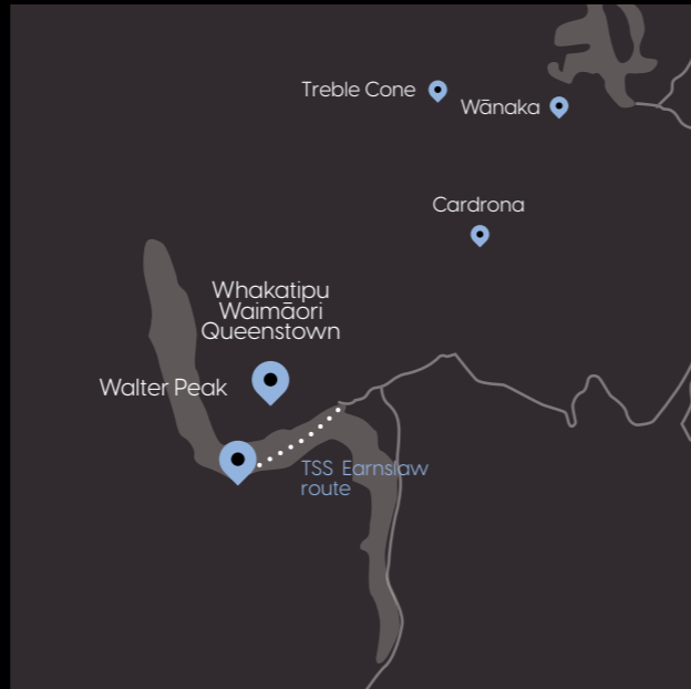
Whakatipu Waimāori Queenstown and Walter Peak