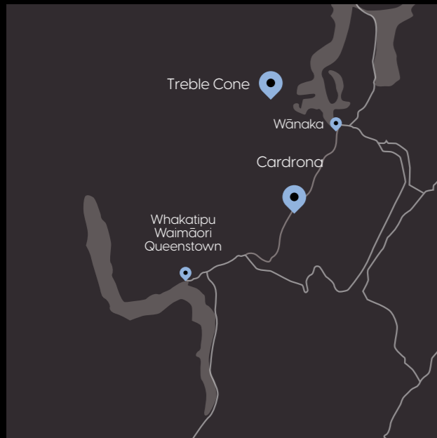
Cardrona Alpine Resort and Treble Cone