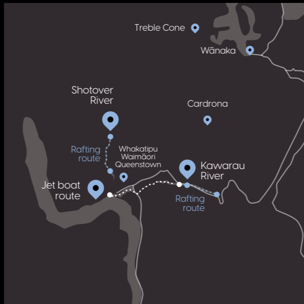
Kawarau, Shotover River Rafting and Jet Boating