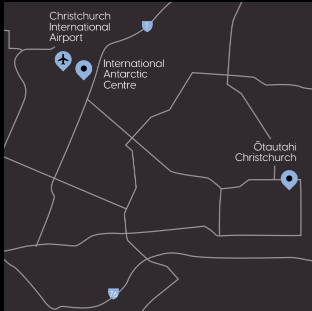
International Antarctic Centre